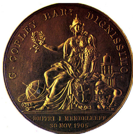
Figure 1. Copley Medal (1905) awarded to Dmitrii Mendeleev. (From Mendeleev Museum Archive, St Petersburg State University.)

Another Russian scholar, the talented chemist Dmitrii Mendeleev (Mendeleeff) (1834–1907), who formulated the Periodic Law and created the periodic table of chemical elements, was well known in Great Britain. 27 In 1872, during the International Exhibition in London, Mendeleev was given a medal for important discoveries and inventions. 28 Ten years later, the Royal Society awarded him the Davy Medal (jointly with Lothar Meyer (1830–1895)), the highest honour for a chemist. 29 Mendeleev gave many lectures and talks at British universities on the occasion of his being granted honorary doctorates. He delivered talks in Edinburgh (1884), Cambridge (1894) and Oxford (1894). In 1888 he became an honorary member of the Royal Society of Edinburgh, and a year later an honorary member of the Royal Irish Academy (1889). In addition, he was a member of the Royal Institution of Great Britain (1891) and other British societies. In 1892 he became a foreign member of the Royal Society. 30