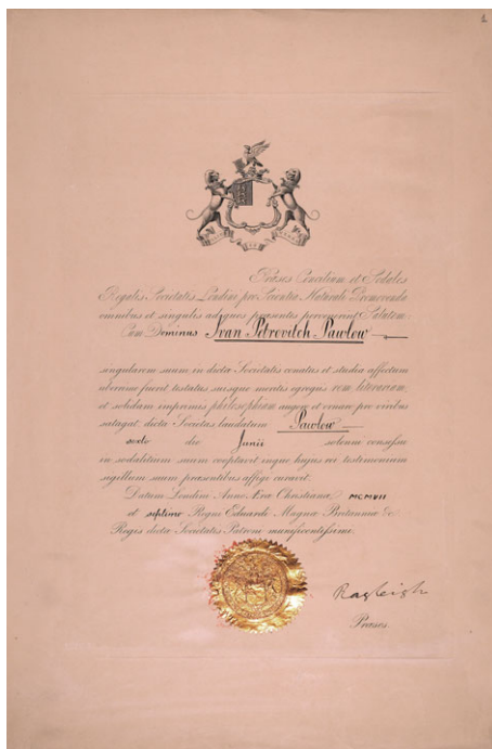
Figure 3. Certificate of the election of Ivan Pavlov as a foreign member of the Royal Society, 1907.