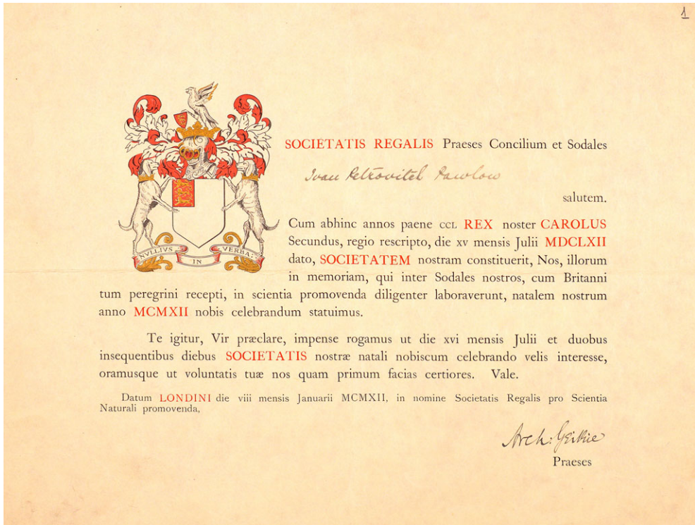
Figure 4. Letter of invitation of Ivan Pavlov to celebrate the 250th anniversary of the Royal Society of London, 1912. (From the St Petersburg Branch of the Archive of the Russian Academy of Sciences.)

the war, he visited England on a number of occasions: Barcroft pointed out that Pavlov had attended the Neurological Congress in London in 1935; and in 1928, he gave the Croonian Lecture at the Royal Society. This lecture, named after William Croone (1633–1684), is a prestigious lecture in the biological sciences delivered annually at the invitation of the Royal Society. When describing Pavlov's character, Barcroft emphasized that 'no better example than Pavlov could be quoted to illustrate the kinship between simplicity and greatness'. 57