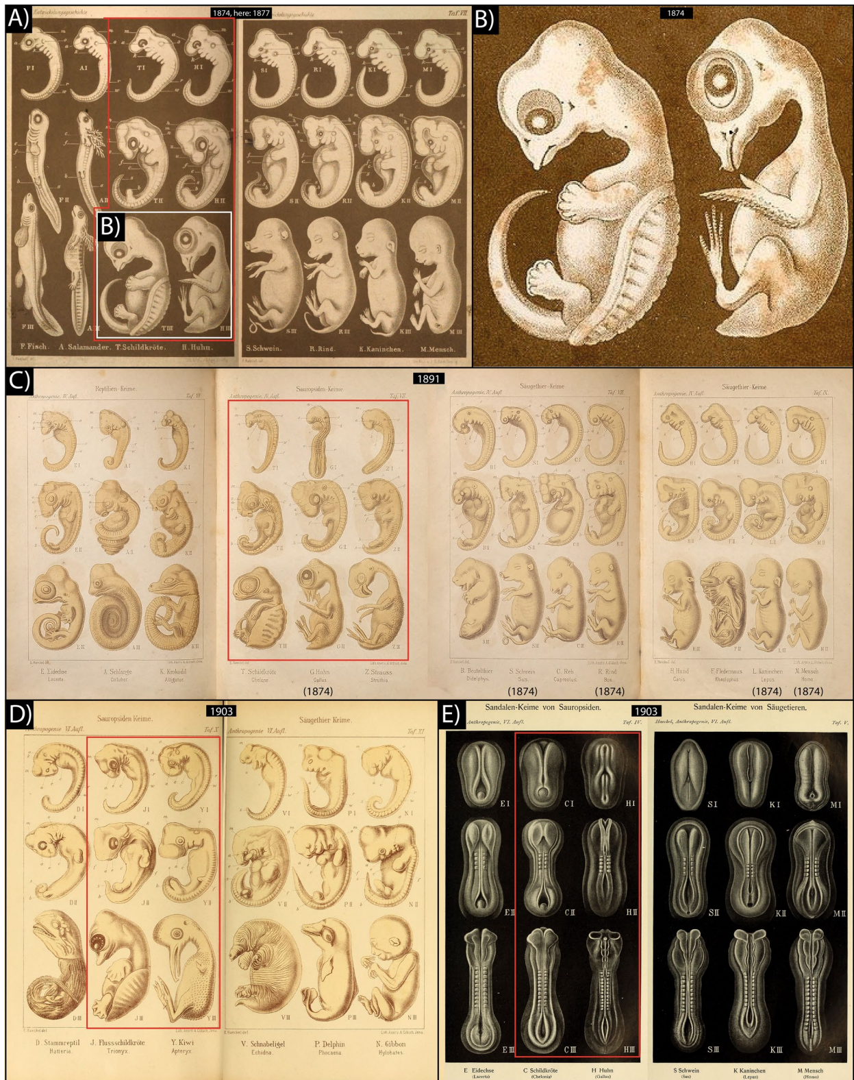
Fig. 2 (See legend on previous page.)